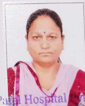
Patel Hospital Pvt. Ltd. Civil Lines, Jalandhar DONOR

(Photo of Recipient & Donor must be signed and stamped across the photo after affixing)