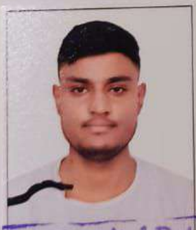
Patel Hospital Pvt. Ltd. Jalandhar RECIPIENT

Relation of donor with Recipient..... Son & Mother